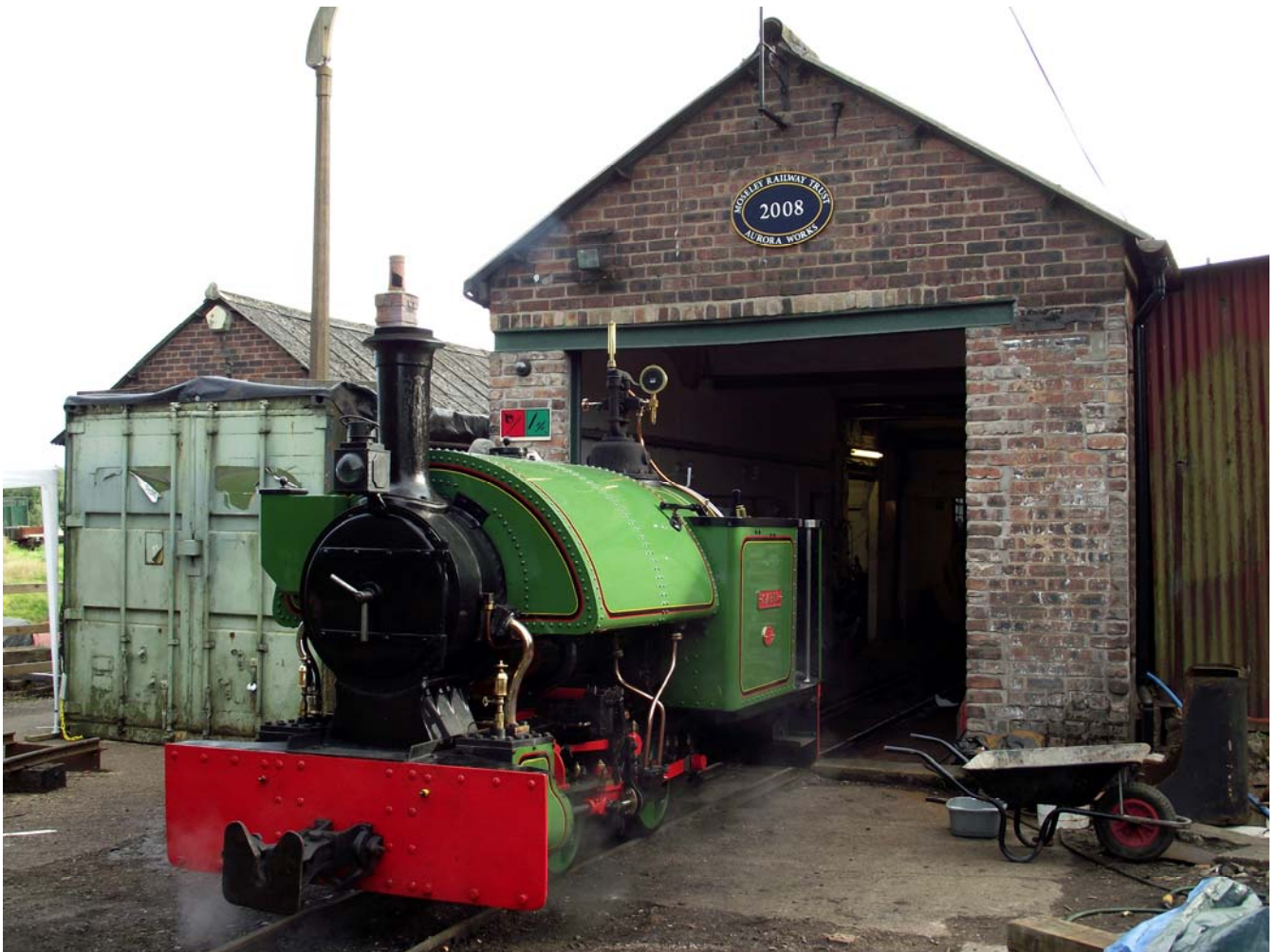
Isabel sits outside a rather different loco shed at Aurora Works at the end of a successful day at the Apedale Valley Light Railway's September 2011 Gala