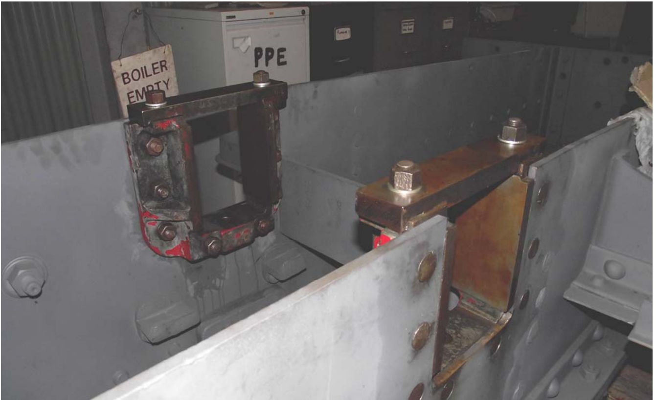
Lorna Doone's Driving axle horns and keeps set up on the shotblasted frames