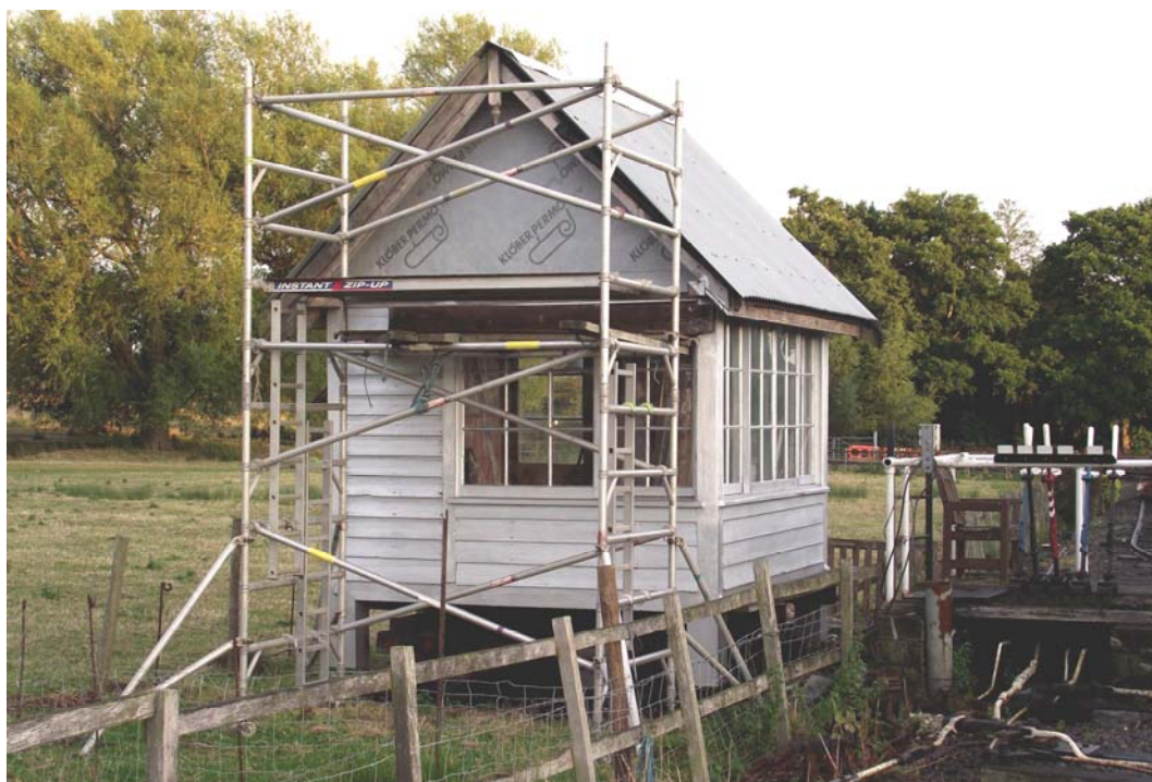
Scaffold tower erected to the gable end of the Waterhouses signal box

effectively. The new wood shed is certainly well stocked at present, but our supply of good cotton rags is very low, any donations? New racking has also been erected in the workshop next to the machine shop, but is empty as yet. The planting beds have all been well attended throughout the season and the unseen task of emptying the bins have kept the platform looking smart. The sinks, toilets and tea station also received an overhaul, prior to the Gala, a huge improvement. An open circuit in the upstairs ring main was detected and solved and some minor redecoration carried out.