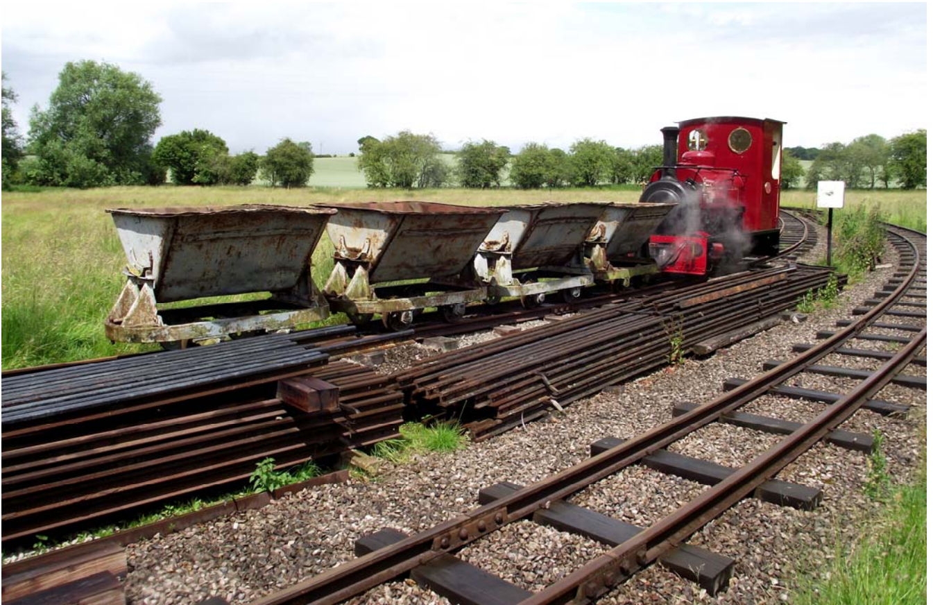
Statfold waits at Chartley Road Loop with the train of skips