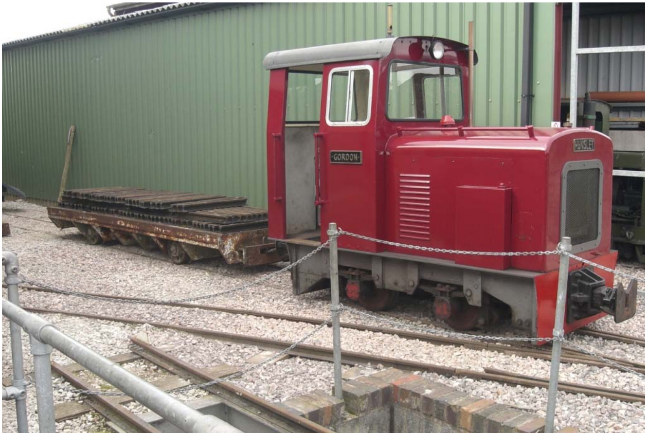
Hunslet Gordon shunts an Allens flat on the newly completed ballasted area