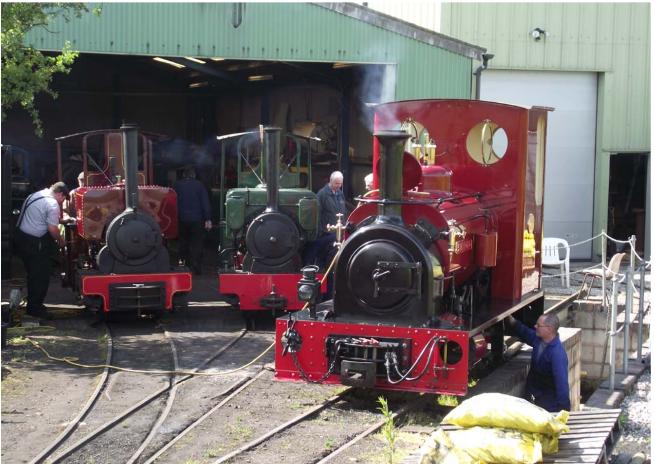
Raising steam on the Sunday morning of the Gala