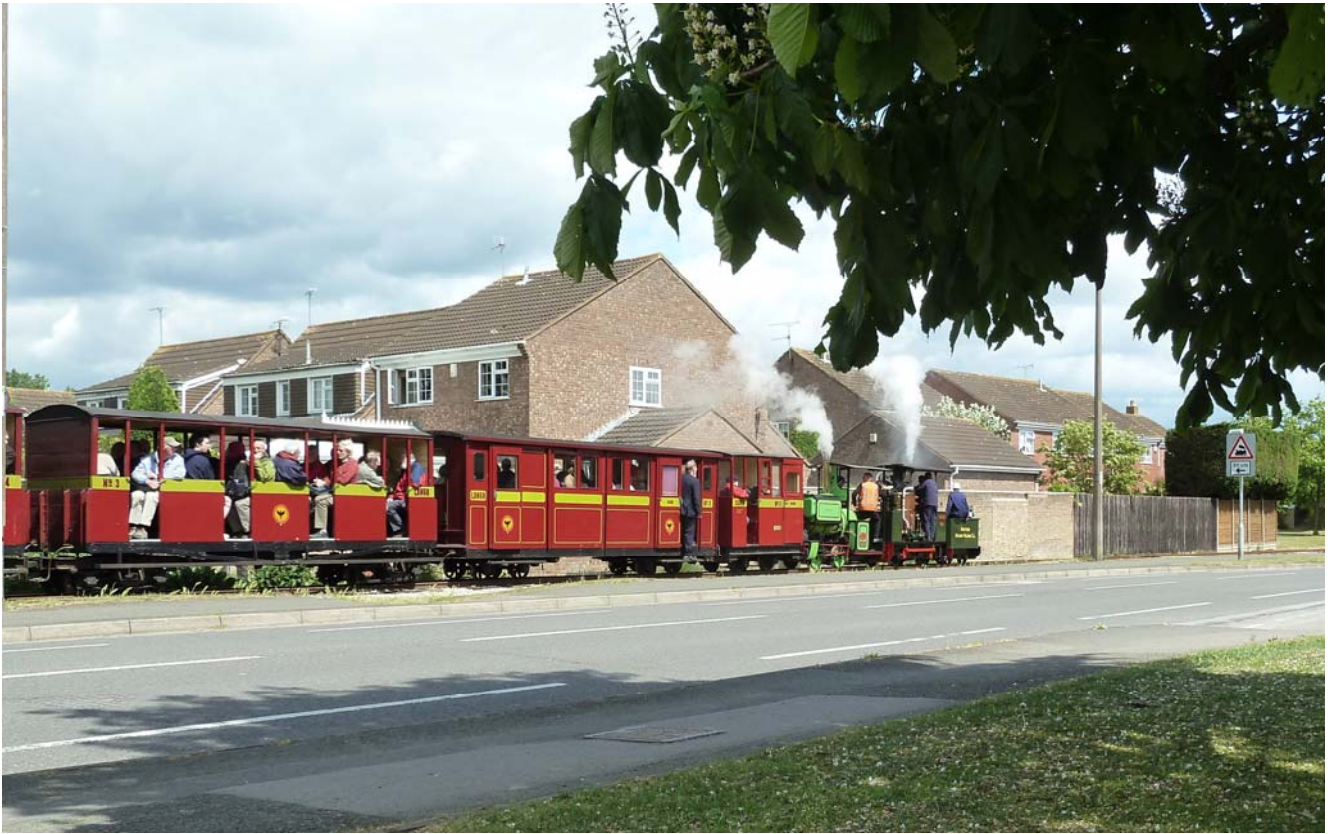
Paddy and Pixie double head their train on the Leighton Buzzard Railway