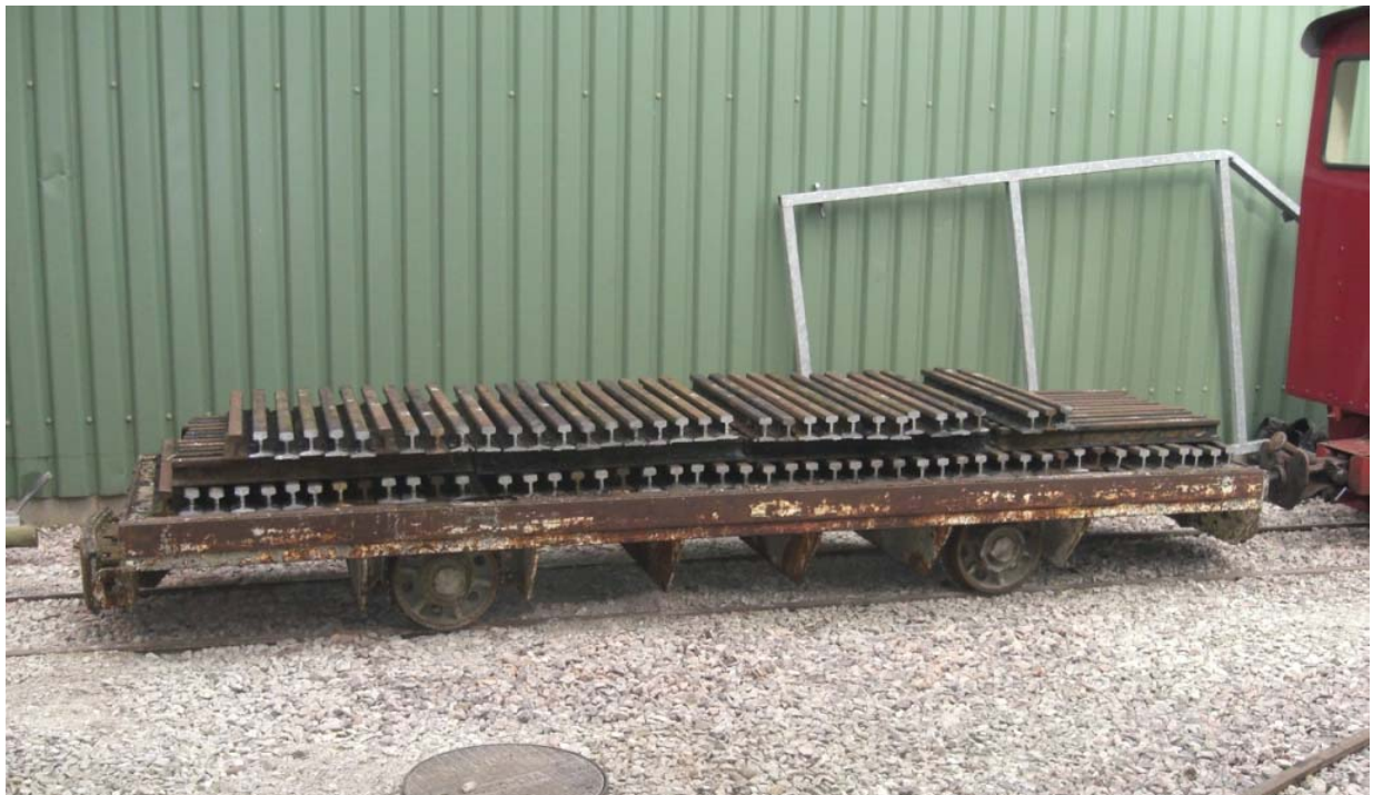
Scrap rails cut to length for the ballast retention works

Ballast has been topped up at these locations and should now stay there though the sheep at Two Trees are an eternal problem. The dips in the track either side of Bridge 2 have been repacked and with the ballast retention boards should be more permanent. All the turnouts have been greased up and other areas of ballasting carried out. The crossing timbers at Goat Paddock crossing have been removed due to rot and the area stoned up to rail level prior to fixing new timbers in due course, the carriage shed and much of the yard has now also been stoned up to rail level to improve underfoot conditions. The 'new' turnouts have been moved up to Stump Siding and their sleepers removed.